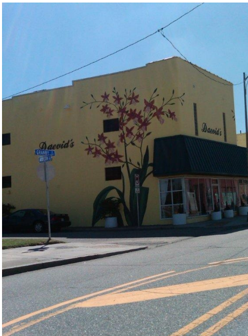
Largest Orchid Painting in the World

Thanks to all VOS volunteers that helped make each sale a success!